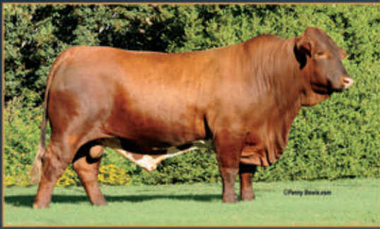
Sugar Dream CF Sugar Britches X Piggy Too