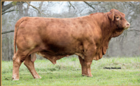
N-Sync Synergy X Oasis