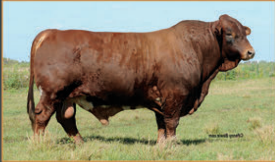
Playmaker Cavalier X T-Bob Playmate