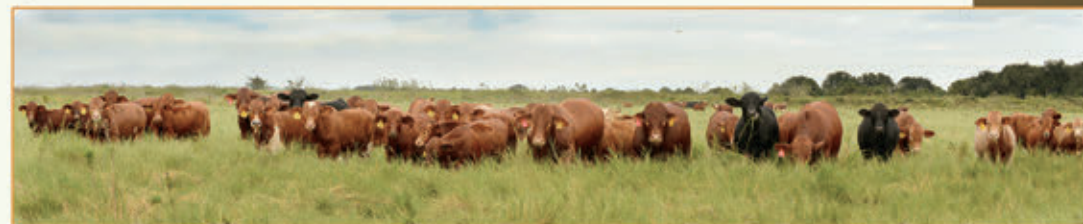
Large number of commercial Beefmaster bulls for sale and ready to go to work.

Zipperer Beefmasters is dedicated to customer service. We value our customers and want every experience with Zipperer Beefmasters to be a good one. Please explore our website and contact us about how we can assist you in finding the best Beefmaster genetics for your operation no matter where you are. Whether you need 1 or 200, we can meet your needs. We encourage all of our customers to come to the ranch