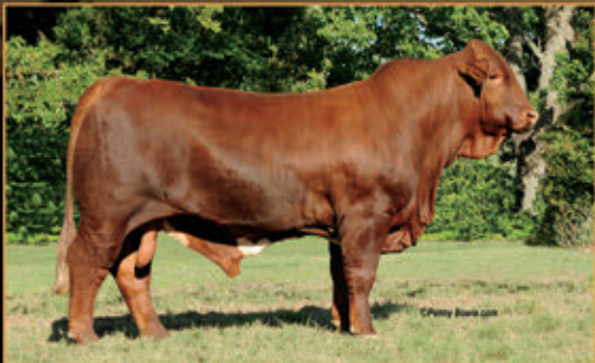
Z Bonanza CF Sugar Britches X CF 175